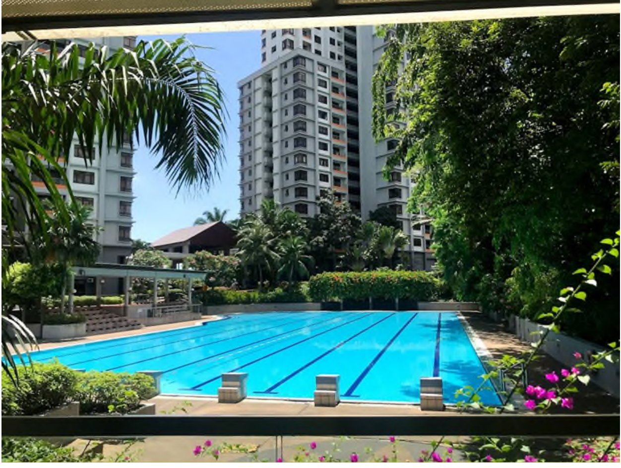
Photovoice artifacts. Above: Olympic-sized pool and manicured landscaping at one participant's rented condo.

Popular Self-Reward #2: Making Great Holiday Adventures. When discussing what participants did to maintain their well-being in the interviews and supporting these discussions in the photovoice and memory box data, participants discussed their frequent and diverse holiday adventures. They emphasized these excursions as a highlight of their experiences teaching abroad. One participant merged their holiday adventures with an interest in cultural learning. This participant's photovoice artifacts included numerous images of the participant's engagement in cultural learning, which the participant shared also augmented their ability to teach culturally responsively. The participant saw these experiences as intrinsically satisfying rewards that they could integrate their holiday learning in the classroom. Below, a Buddhist monastery can be seen amidst green foliage nestled in mountainous terrain. The image itself shows the beauty of one chosen holiday spot. The monastery was a place where the participant could consider what the culture valued and gain a more historical understanding of the land they were teaching on. The