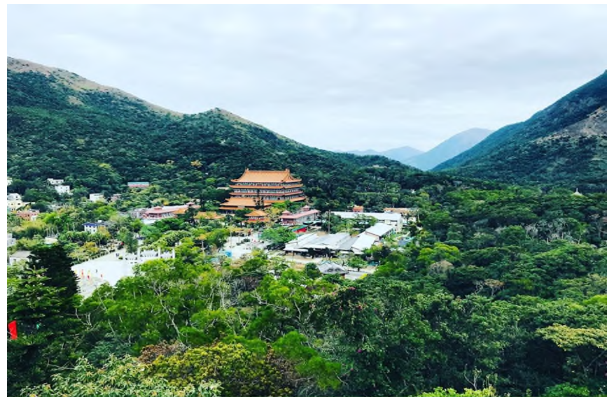
Photovoice artifact. Above: Buddhist monastery

great holiday adventure is a type of self-reward that could only be experienced periodically. Instead of providing integrated relief like the comfortable home living reward, the holiday adventure offered a longer-term incentive to work through the challenges that teaching brings, with the knowledge that a reward would come after a certain interval.